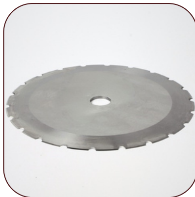
Fish Processing Knives