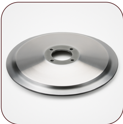
Salmon Slicer Knives