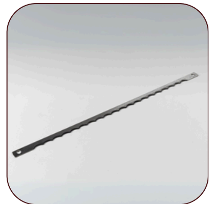
Bread Slicer Knives